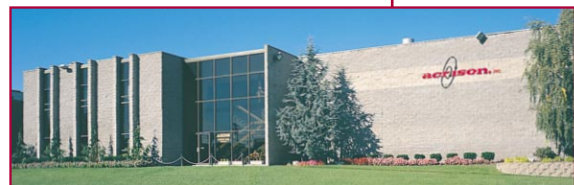
Empire Boulevard Facility Moonachie, NJ USA

20 Empire Blvd. Moonachie, NJ 07074 USA 201-440-8300 • Fax: 201-440-4939 Email: informail@acrison.com Website: www.acrison.com