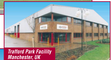
Trafford Park Facility Manchester, UK