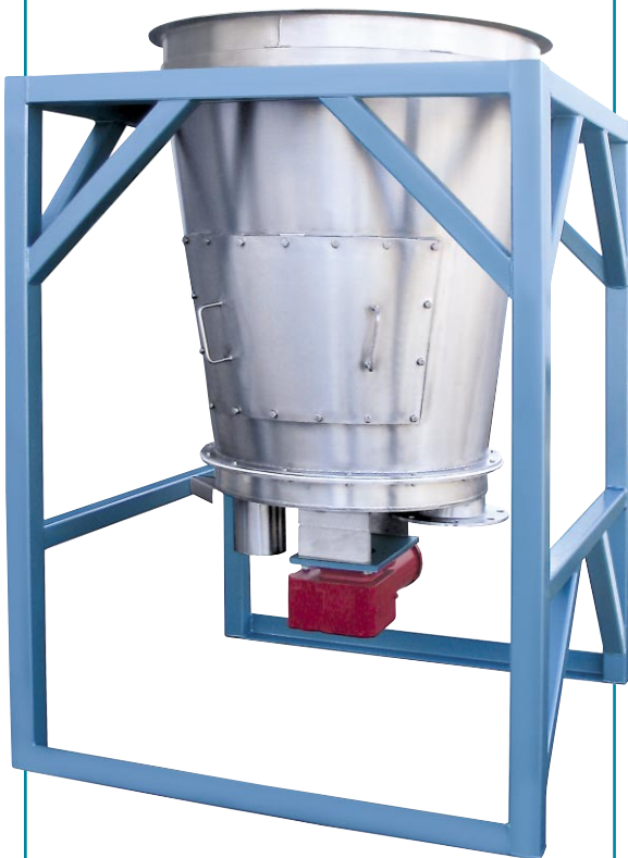
Model 170-BD-30 Bin Discharger with storage bin

The second outlet is a novel “Discharge Port” that allows the contents of the Bin Discharger, and its associated storage bin, to be emptied rapidly, ideally suited for frequent product changeovers. The “Discharge Port” is normally furnished with a manually operated slide gate valve, although it can also be equipped with an automatically operated valve. And because the Bin Discharger itself is self-emptying, total cleanout is quick and easy.