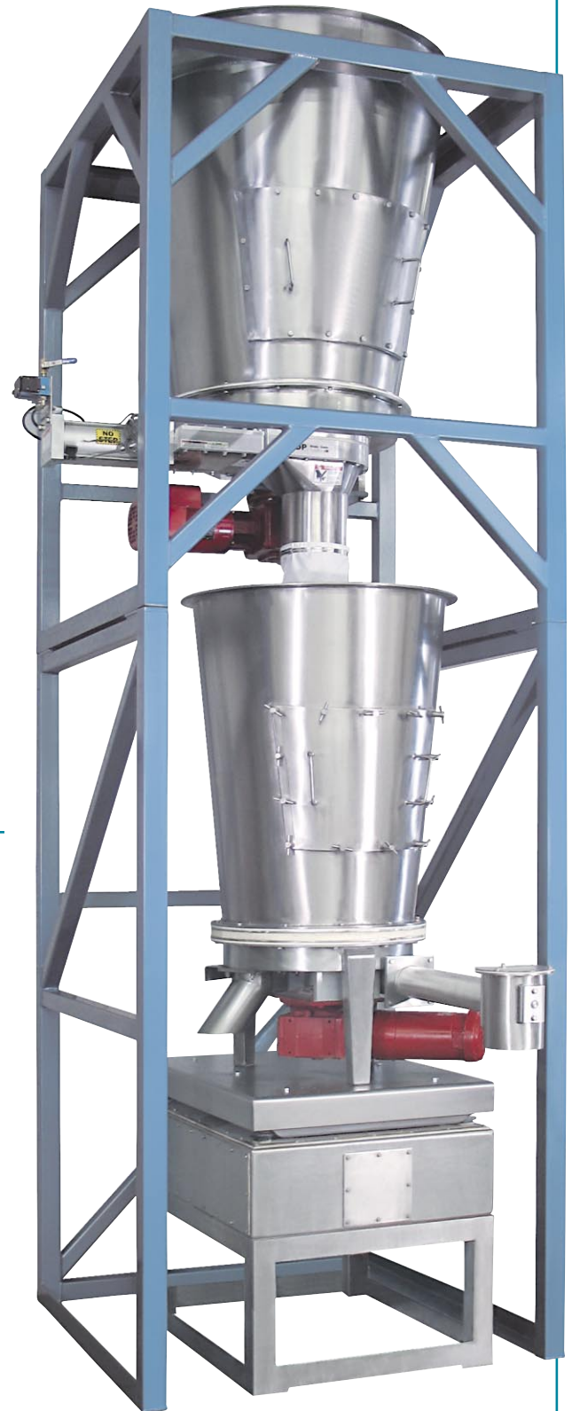
Model 170-BD-30 Bin Discharger with storage bin and an automatically operated discharge valve for refilling a "Weight-Loss" Weigh Feeder