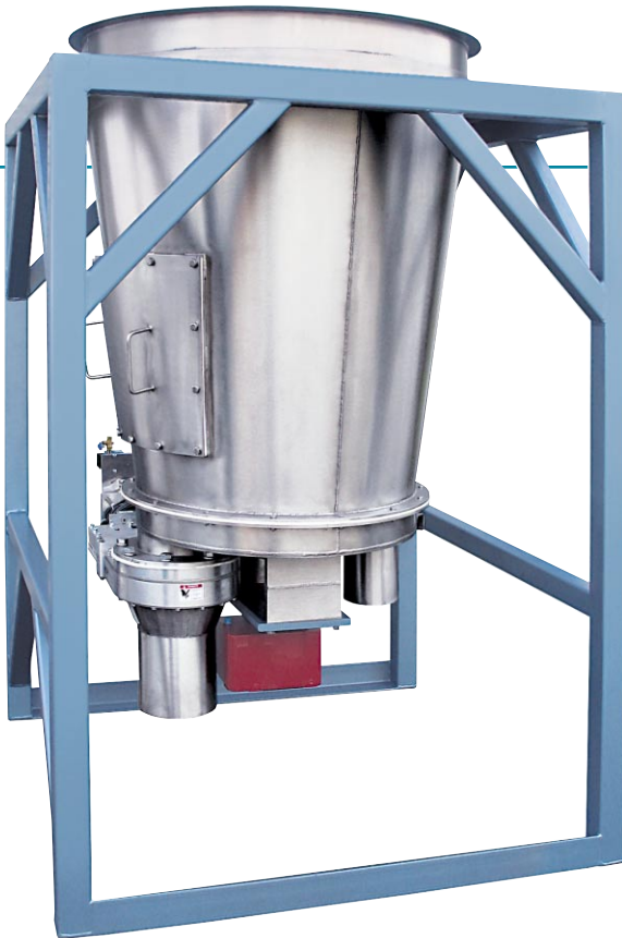
Model 170-BD-30 Bin Discharger with storage bin and an automatically operated discharge valve

The agitator of the Model 170-BD-30 is driven by a constant speed, heavy-duty gearmotor drive.