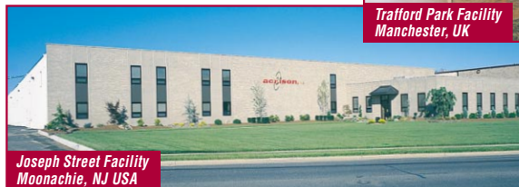
Joseph Street Facility Moonachie, NJ USA